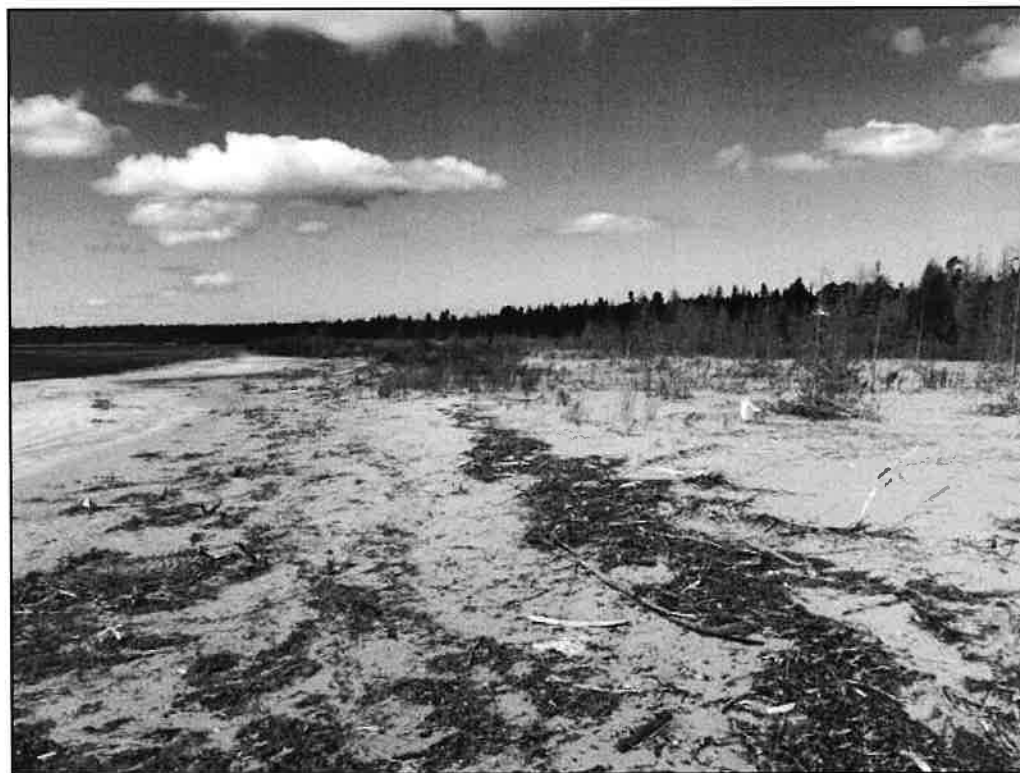
Beach south of Blue Jay Creek, looking north towards mouth, 2021. The last major patch of Phragmites (distance; left of centre) was controlled this year.