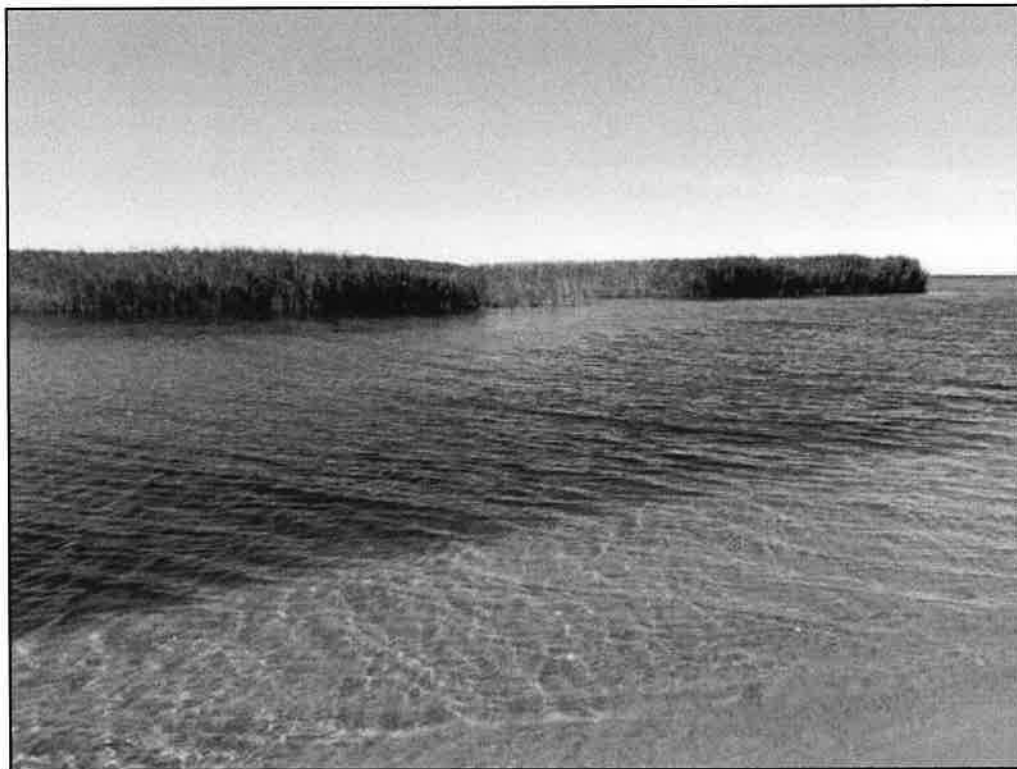
Mouth of Blue Jay Creek, 2016, before control, looking south.