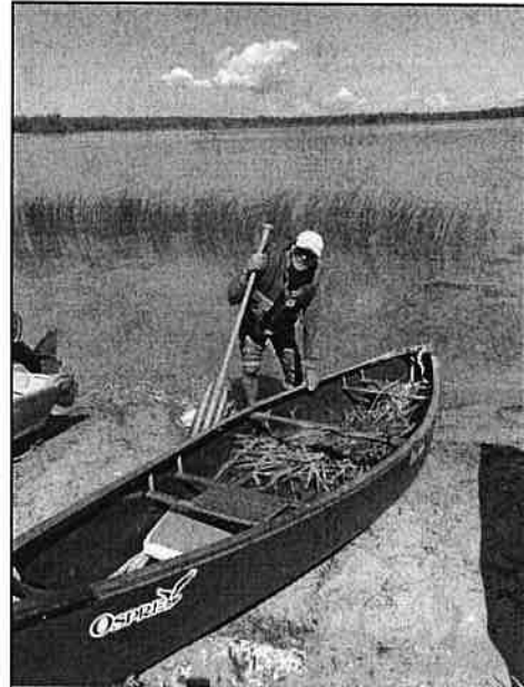
Phrag Watcher shows off after annual clean up at Mac's Bay.

Don't Drive Through Phrag! Phrag is mainly spread by ATVs and machinery. Phrag may spread back into our control sites because the water in Lake Huron continues to drop, and people can drive on the shore again. We continue to advertise (newspaper, radio) the Don't Drive message. Working with Fuel the Fire TV and with extra funding from the Canadian Wildlife Service, we also filmed a more general 30 second commercial about responsible ATV riding. You can see it on the Project's YouTube channel or on FTFTV.